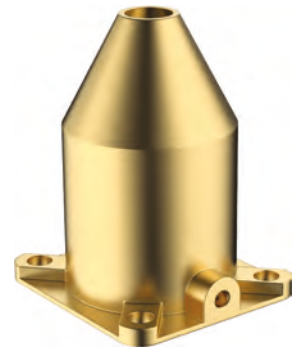
"X" & "Y" Type